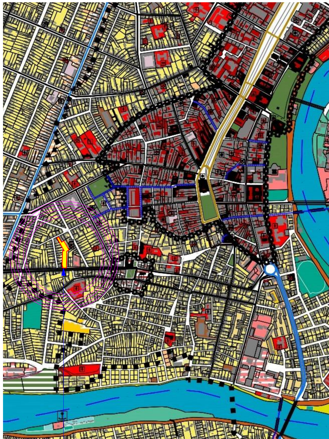
TEREN STUDIAT IN PUZ